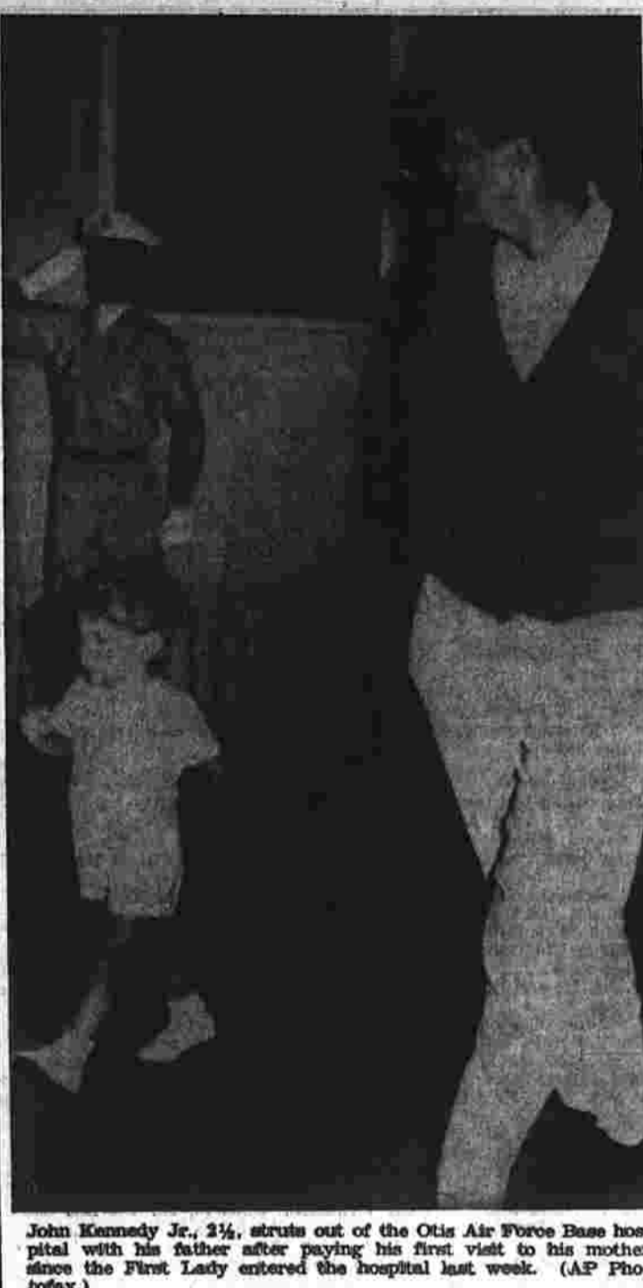
John Kennedy Jr., 2 1/2, struts out of the Otis Air Force Base hospital with his father after paying his first visit to his mother since the First Lady entered the hospital last week.

EDITOR'S NOTE—The author of this article is one of the hundreds of East Germans who have escaped to the west despite the Berlin wall, barbed wire, mine fields and trigger-happy guards.